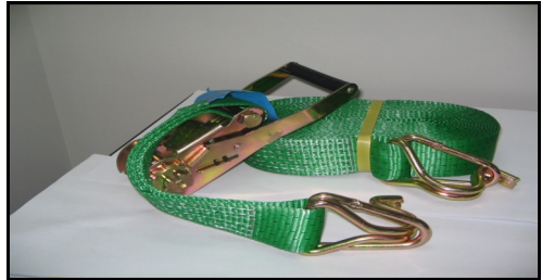
2" RATCHET STRAPS —10m x 50mm Quality Strap, 2,500kg Load Restraint Capacity, 5,000kg Breaking Strength

So what are you waiting for?? HURRY! While Stocks Last!!