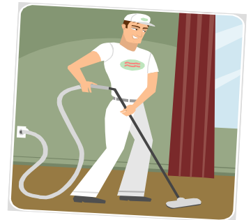
Spring is in the air! Time to get cleaning!!

That being said, we would like to sincerely thank many of our valued customers & their clients who remained understanding, patient and co-operative for their continued support.